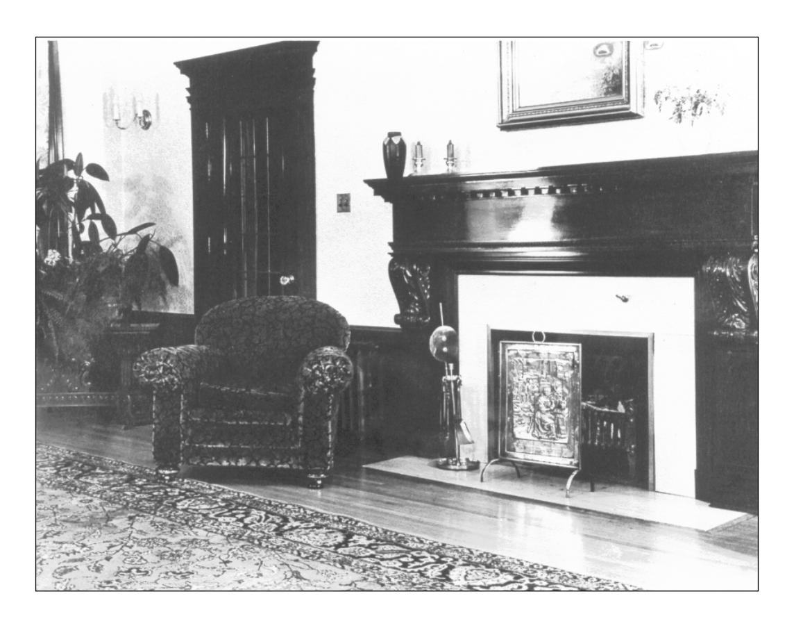
Plate 7 – The drawing room, 1934.