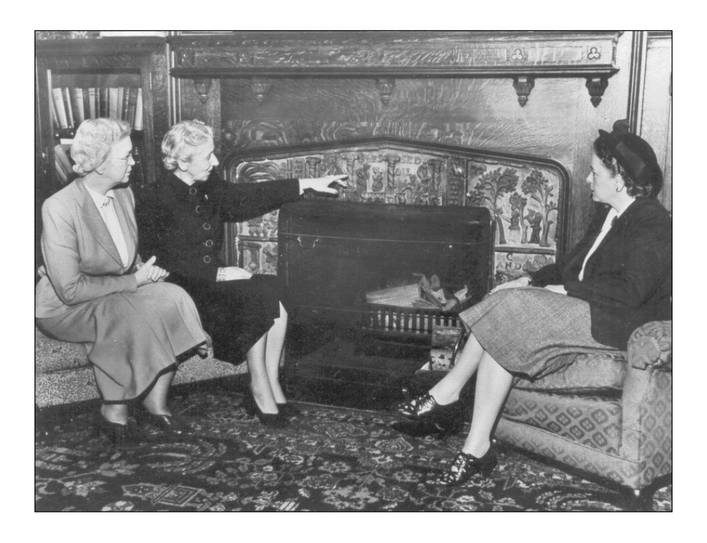
Plate 5 – A remarkable fireplace in the Ralph Connor Room of the University Womens' Club, 1951.