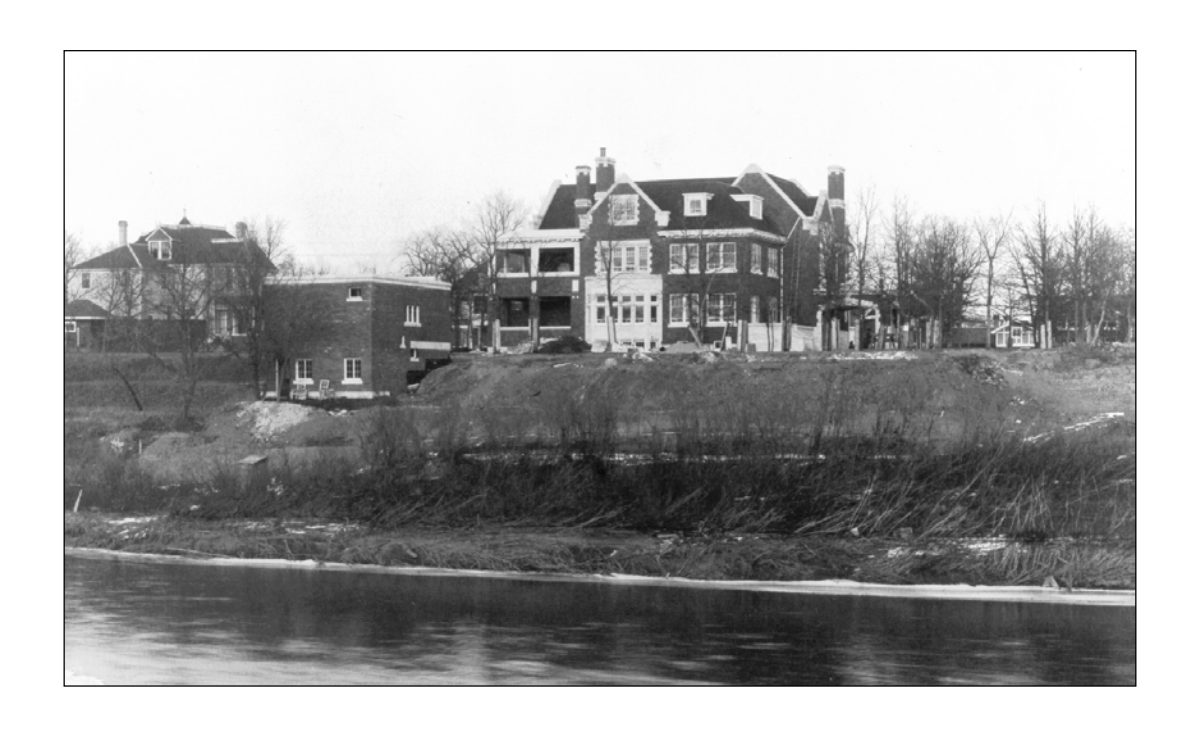
Plate 2 – The rear elevation from the river.