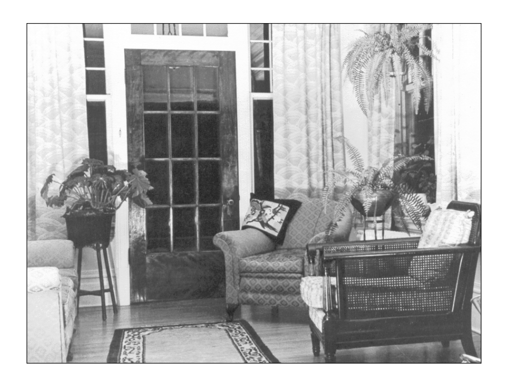
Plate 6 – The sunroom, 1934.