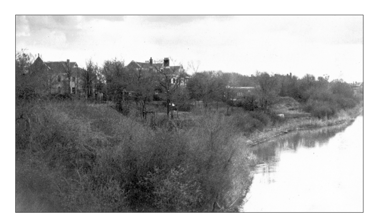
Plate 3 – 54 Westgate from where the Maryland Bridges now stand, ca.1915.