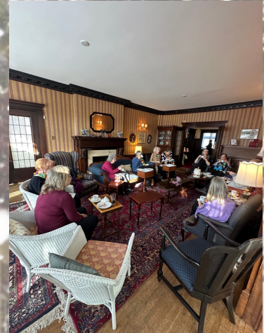
A selection of photos from the Fall