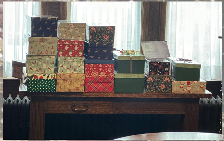
Our growing collection of Shoebox donations!