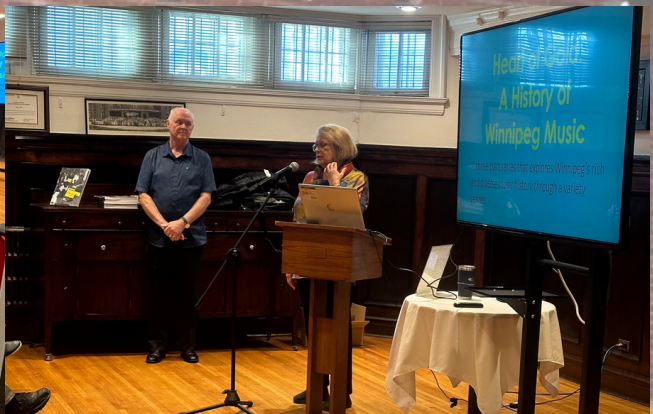
The crowd finding their places for the start of Con. Ed.'s Heart of Gold