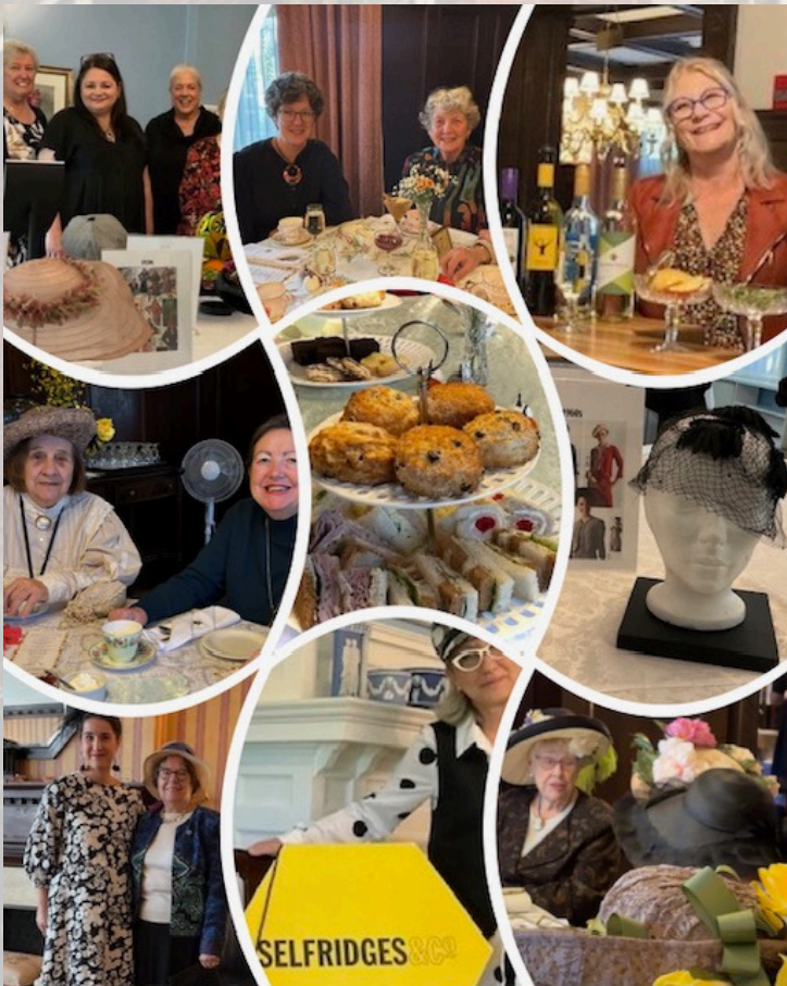
A collage of photos from UWC's fundraiser tea in collaboration with the Costume Museum of Canada