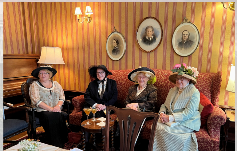
Our members really met the challenge of finding great hats - and outfits to match!